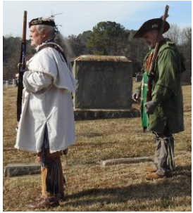
Wreaths Across America, Taylorsville City Cemetery, Taylorsville, NC

Catawba Valley Chapter of the Sons of the American Revolution