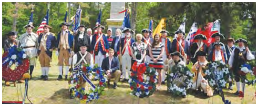
Participants gather in front of the monument recognizing the stand taken by a distressed people for justice and equality, for freedom from tyranny.