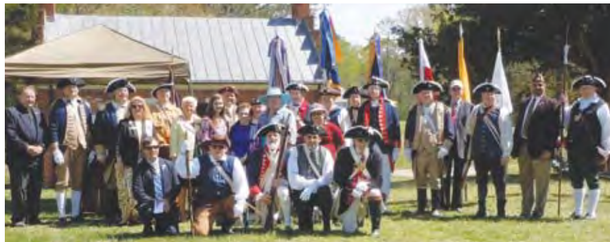
Participants in Halifax Resolves Ceremony