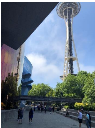
Seattle Space Needle