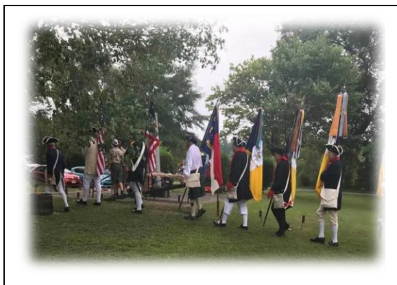
2021 Commemoration of the Battle of Rockfish

We are almost back to a new near normal. We met at Congress in Seattle after having to cancel the Congress in Richmond, last year. I will attach the Power Point that I gave at our last meeting with more pictures and story of the event. I had met a family from Seattle while camping in Holland once, and they were absolutely right in their praise and description of a beautiful city full of trees and almost surrounded by water. I could learn to love the Pacific Northwest except for the traffic and prices. I think I have seen as many seaplanes takeoff of the lake by the hotel as I have seen in movies. We have a new President General, heard a patriotic yet not political speech by a great General (Mad Dog Mattis) and enjoyed