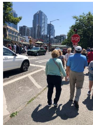
Entrance to Pike Place Market