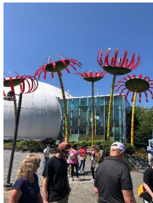
Chihuly Glass Garden