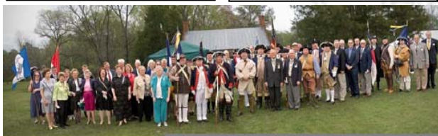
Some of the SAR participants at the 2008 celebration