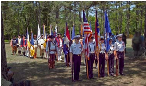
(above) The JROTC color guard followed by the NCSSAR color guard line up