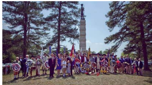
(above) The NCSSAR contingent