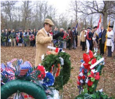
The presentation of the Halifax Resolves Chapter wreath at the battlefield of Cowpens, SC, on 1/17/04.