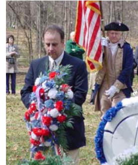
The presentation of the chapter wreath at the battlefield of Guilford Courthouse on 3/13/04.